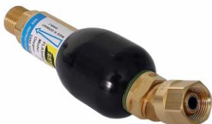
Part number: 21125 Flame arrestor, oxygen