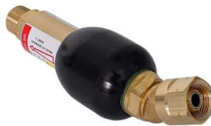
Part number: 21124 Flame arrestor, Propane/acetylene