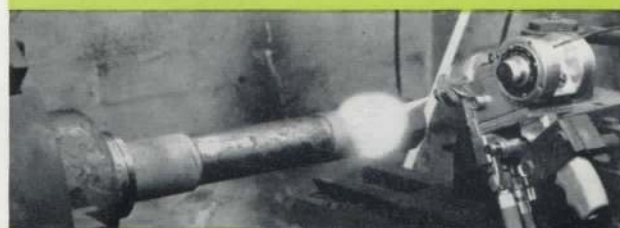
FOR BUILDING UP