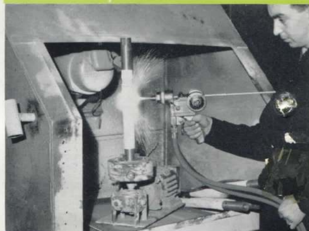
OR SPECIAL COATINGS

The Mark 40 meets YOUR requirements for EVERY application !