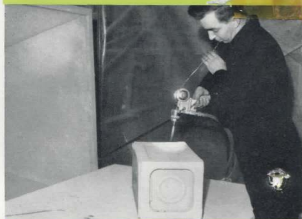
IN THE FACTORY